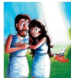
ATONEMENT —According to the Plan of Redemption, the animals' deaths would represent Adam & Eve's deaths.

Notice some things we learn from animal sacrifice: